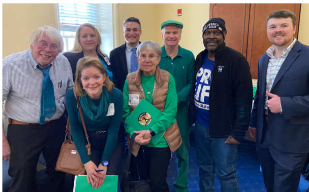
In February, Maryland Right to Life participated in a lobby day against assisted suicide at the State Capitol organized by our friends at The Dignity Mandate.

This session, MDRTL initiated a $20,000 digital ad campaign to mobilize public opposition to assisted suicide. With the help of allied groups, The Dignity Mandate and Patients' Rights Action Fund, the campaign hit 460,000 views . The ad highlighted some of the dangers of assisted suicide and urged viewers to contact legislators.