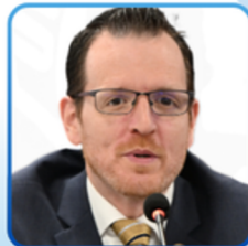
Senate Minority Whip Justin Ready